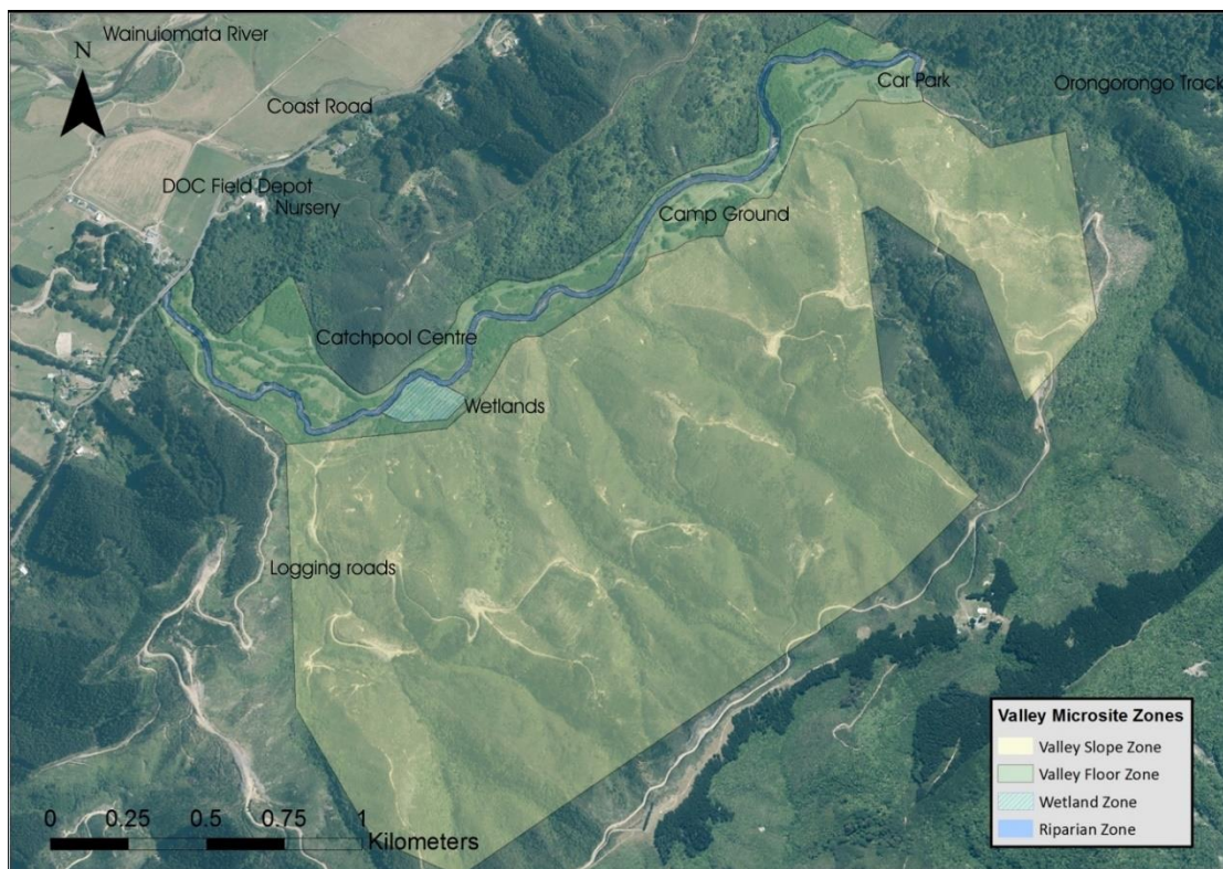
Catchpool Restoration Project Eco-Habitat Zones

Remutaka Conservation Trust – www.remutaka.nz/